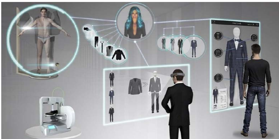
Figure 3. The Simulation of Human Intelligence Processes By Machines.

Traditionally, retailers depend on data from the previous year that was unsafe to adapt to evolving Patterns to focus their estimation of current year revenue. Predictive mistakes should be minimized by 50 percent (Forbes, 2019) to avoid overproduction and large volumes of leftovers.