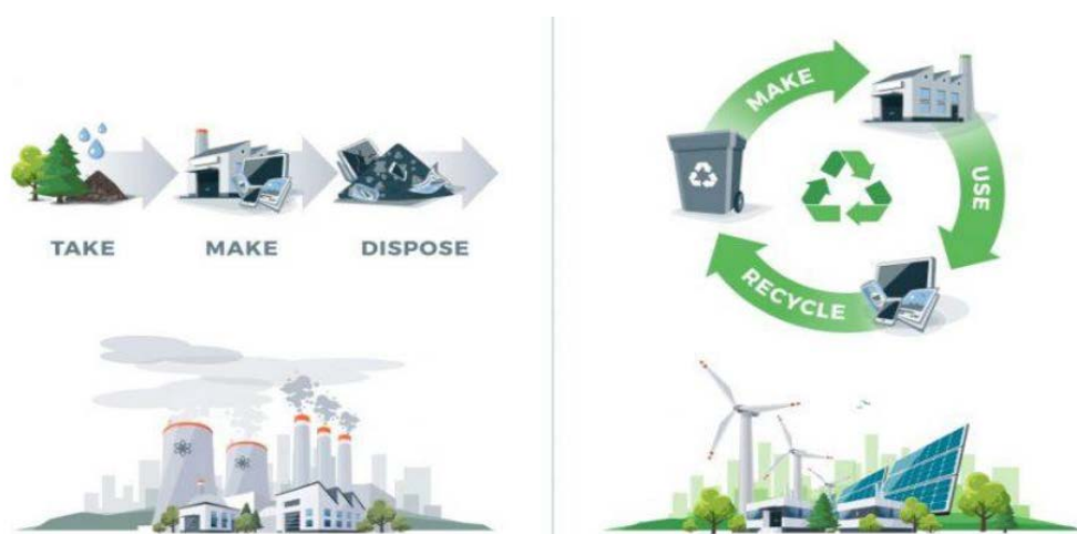
Figure 1. A General Process of Recycling.