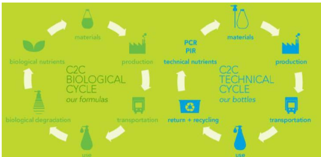
Figure 6. The Biological Cycle For Formulas And Bottles.

While speaking concerning the circular economy and the different models, it's necessary to differentiate between “short-life fashion” and “long-life fashion”. Reusing, reselling, upcycling, and remanufacturing makes sense on clothes with durability, quality production, and long usages. Instead, merchandise that are made with quality through quick production systems typically don't have enough price to be repaired or resold, thus this merchandise ought to be taken back to recycle (Mistrafuturefashion, 2017). As mentioned in our former chapter “waste as new raw material”, the methods, innovations, and technology are thus far still limited, and utilize on its own isn't sufficient to scale back simply textile waste and doesn't address the difficulty of resource scarceness for giant fashion companies. Textile-to-textile usage is a thanks to address each problem with resource scarceness and textile waste in landfills. Major fashion companies, like Adidas, Levies, Patagonia, H&M and PVH are already dedicated to rising their processes and material selections towards a greener future. so, they're cooperating during a kind of alternative ways with forward-thinking and innovative makers or start-ups however conjointly invest by themself in new innovations and ideas to become a lot of property and satisfy the new shopper requirements. As analysis shows, eighty-eight of customers wish fashion brands to assist them to be a lot environmentally friendly (Forbes, 2020).