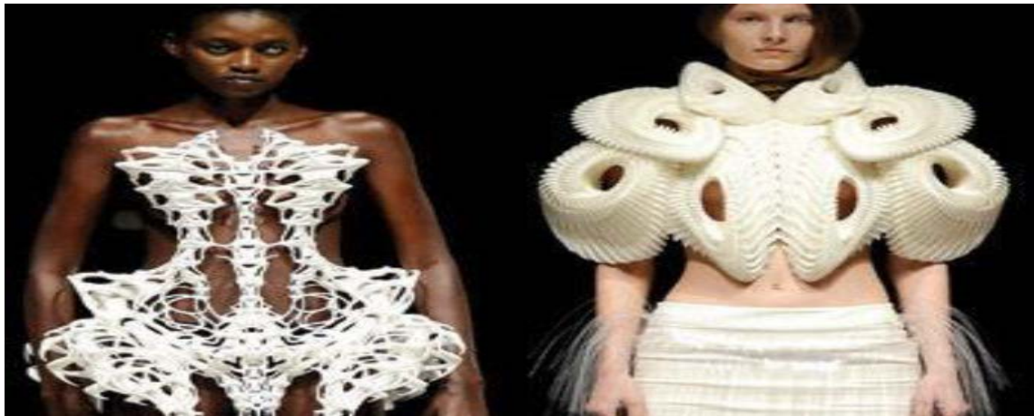
Figure 4. 3D Printing Technology.

mentioned within the context of digitalization or trade 4. 0. ab initio employed in the development of prototypes; AM contains a heap of potential, particularly within the areas of textile products similarly as textile production processes. This could have an impact on the efficiency of production and helps with the discrimination and functionalization of products (Südwesttextil, 2016). products are often individually custom-made or technical applications can be created and therefore satisfy modern or technical specifications.