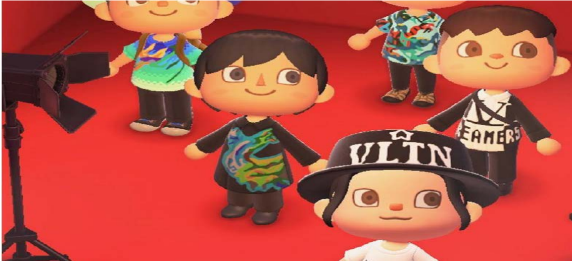
Figure 5. Virtual Worlds

Reference Festival, the Nintendo Game Animal Crossing takes its fashion potential one a step further with a virtual fashion show of Animal Crossing Avatars dressed up in current season looks inspired by Loewe, Prada, and GmbH. Such digital innovations show a smart way of saving an incredible amount of money and resources by not purchasing new clothes and still looking sharp in the digital world (Vogue, 2020).