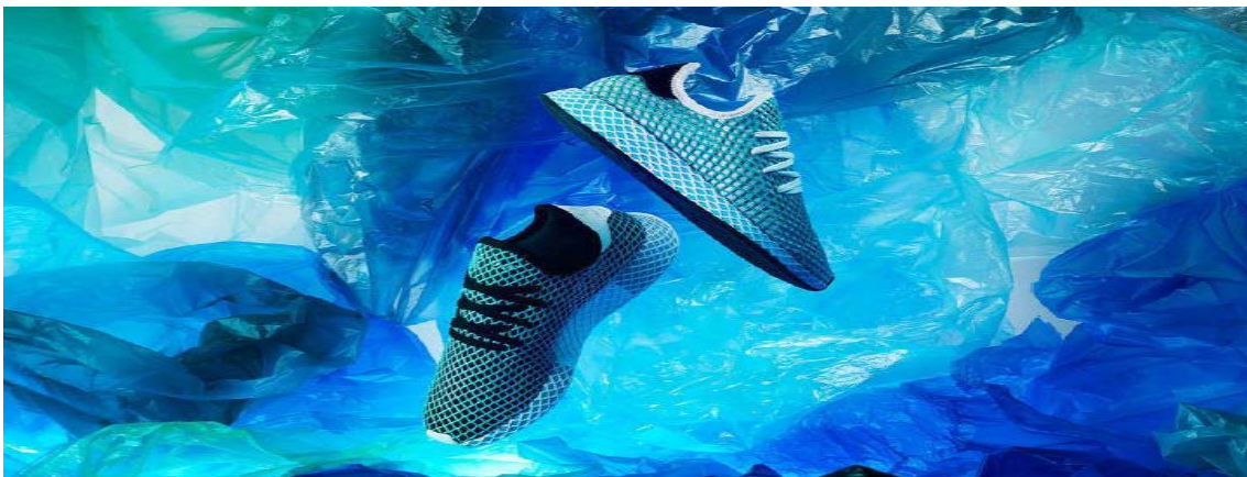
Figure 8. 100% Recyclable Material Shoes.

Another exemplar is that the complete Patagonia who tries, next to its honest trade practices and closely monitored supply chain, to provide durable clothes, with the likelihood to repair them. They also advise customers to shop for used products rather than new ones (Forbes, 2020). PVH invests in technologies to optimize their price chain, making less waste (e. g. Avatars for Prototypes) and to supply their customers transparency inside their products within the future (QR code tags) (Lecture, 2020). And additionally, Adidas develops items, like shoes and hoodies, out of 100% reclaimable material, which is currently tested on elite customers (Adidas, 2019).